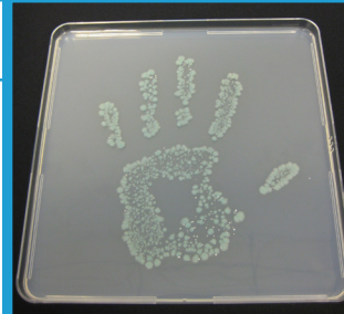
Hand Contaminated with E. coli

http://www.handwashingforlife.com/sanitwice_hand_washing_without_water