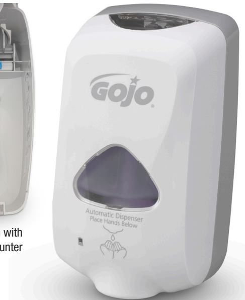
TFX Touch-Free System