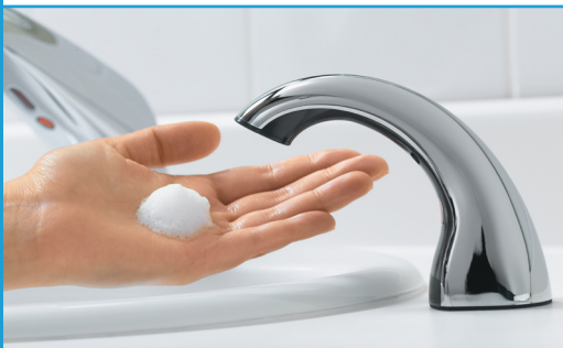
CXi Touch-Free Counter Mount System

These sealed cartridge systems are formulated without the harsh chemicals required to keep open-top dispensers from rearing pathogenic bacteria. Recent studies by Dr. Gerba at the University of Arizona show a 25% bacterial contamination level for open top, refillable dispensers.